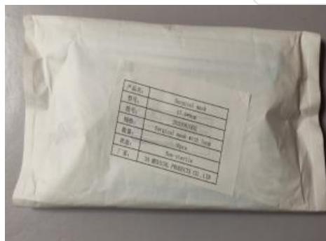
Photo of Samples